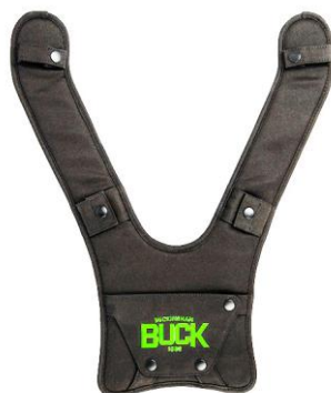
Fig. 2 (Outside of Back Pad)