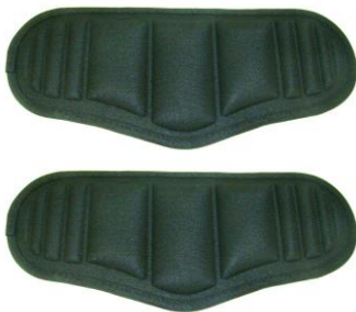
Fig. 9 (Inside of Leg Pads)