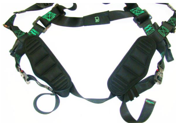
Fig. 15 (Leg Pads Attached to Both Leg Straps) (Lower Harness Section, Back Strap and Below Shown for Clarity)