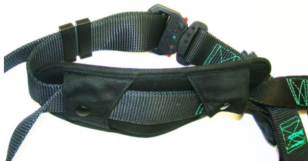
Fig. 14 (Leg Pad Attached to Leg Strap)