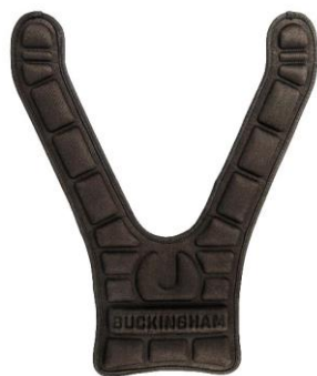
Fig. 1 (Inside of Back Pad)