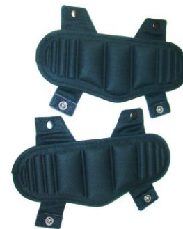
Fig. 11 (Inside of Leg Pads with Snaps Unsnapped)