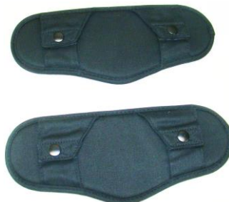
Fig. 10 (Outside of Leg Pads)