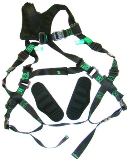
Fig. 12 (Harness Shown with Fall Arrest Attachment Facing Down)

NOTES: When properly attached the Harness Retrofit Leg Pads should appear as shown in Figure 15. It is also possible to attach the leg pads when you are wearing the harness, however reaching behind the leg and properly attaching the snap fasteners may prove difficult for some users.