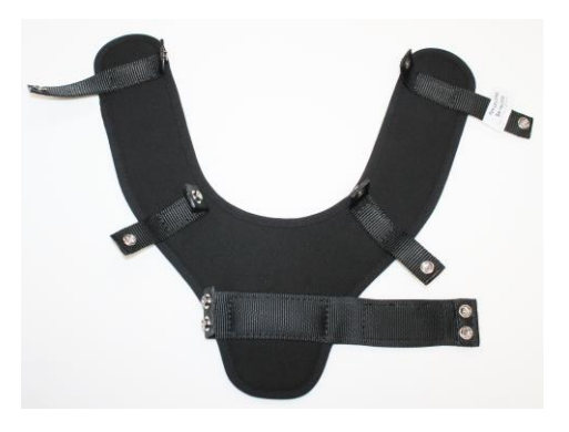
Fig. 1 (Inside of Back Pad)