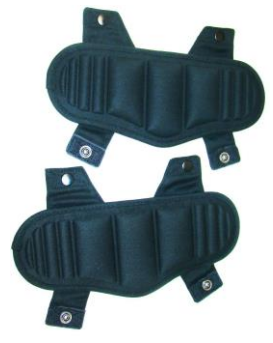
Fig. 9 (Inside of Leg Pads)