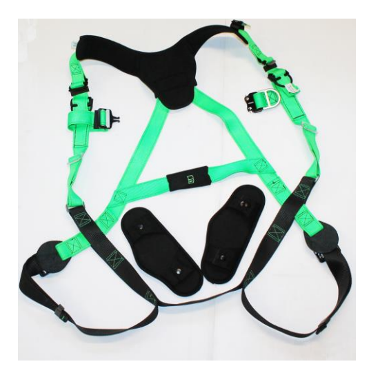
Fig. 12 (Harness Shown with Fall Arrest Attachment Facing Down)

NOTES: When properly attached the Harness Retrofit Leg Pads should appear as shown in Figure 15. It is also possible to attach the leg pads when you are wearing the harness, however reaching behind the leg and properly attaching the snap fasteners may prove difficult for some users.