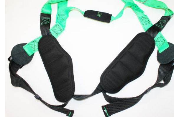
Fig. 15 (Leg Pads Attached to Both Leg Straps) (Lower Harness Section, Back Strap and Below Shown for Clarity)

Clean pads with mild soap & water. Allow to air dry completely (not in sunlight). Your equipment should be stored and transported so that it does not come into contact with moisture, ultraviolet rays, extreme temperatures, or chemical agents. Warnings pertaining to cleaning, storage, and transportation should be strictly adhered to.