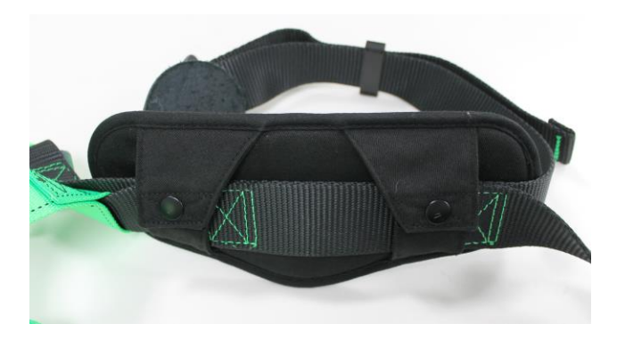
Fig. 14 (Leg Pad Attached to Leg Strap)