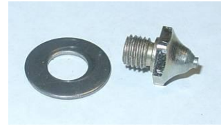
P/N 488S Fig. 1 Threaded Cleat

Note: Ensure the washer is seated on the shoulder of the Cleat (Fig. 5) and not caught under the shoulder. There should not be any space between the Cleat and the washer. (Fig.6).