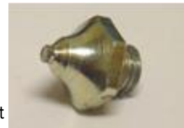
Fig. 2 P/N 483S Threaded Cleat

The Channel Handle / Cam Assembly (Fig.1) is equipped with a Threaded Cleat (Fig. 2). The Threaded Cleat, P/N 483S, is mounted into the frame of the 483D & 484T series BuckSqueeze Channel Handle/ Cam Assembly to provide enhanced gripping abilities. When installing, tighten snugly, do not over tighten.