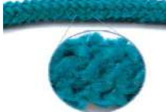
Rope with Excessive Abrasion Wear