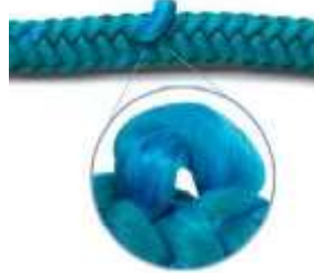
Rope with a Pulled Strand