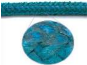
Melted / Glossy / Glazed Strands