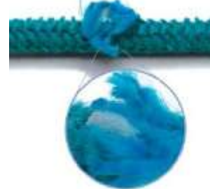
Rope with Broken or Cut Strands