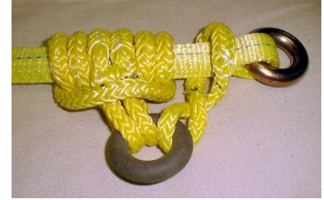
Figure 8 shows the friction saver and prusik loop attached to a tree.