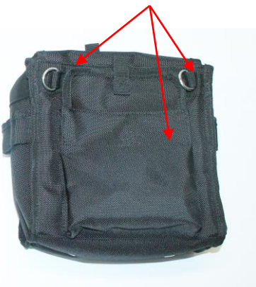
PN 4598S – Front Side Two Tool Tether Attachment Rings & One Accessory Pocket