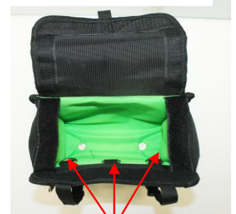
Inside View - Three Tool Tether Attachment Rings