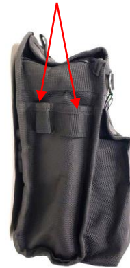
Side View Two Tool Loops