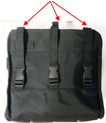
Back Side -Three Harness Attachment Straps. Two Tool Tether Attachment Rings (under straps, not showing)