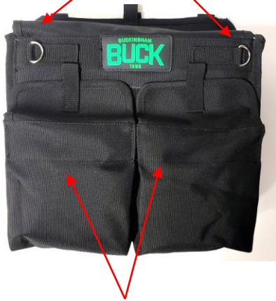
Two Accessory Pockets