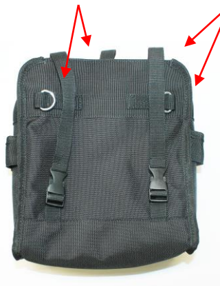
Back Side -Two Harness Attachment Straps. Two Tool Tether Attachment Rings