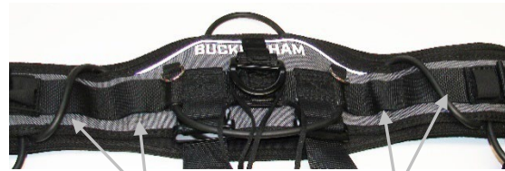
Fig. 2 Accessory slots in back strap webbing