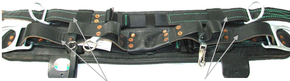
Fig. 3 Locations on belt strap

Dimensions: 4 1/2" High x 3/4" Wide x 1 3/4" Deep