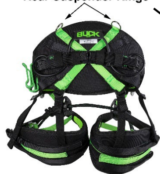
Buck Agility Saddle Rear Suspender Rings