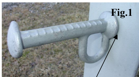
Mount Flange Flush to Support Structure