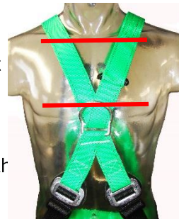
Installation location for Lanyard Parking Attachment on front of harness