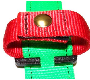
Retro Web Breakaway Loop closed