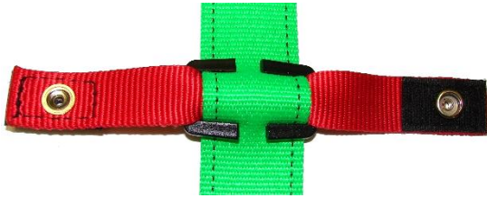
Retro Web Breakaway Loop open