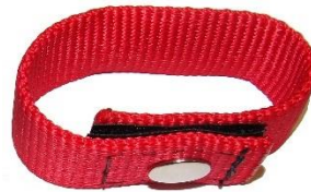
Retro Web Breakaway Loop Fig. 1