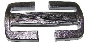
Removable Friction Buckle